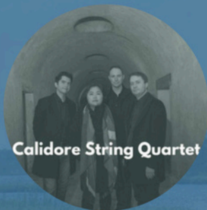
Calidore String Quartet