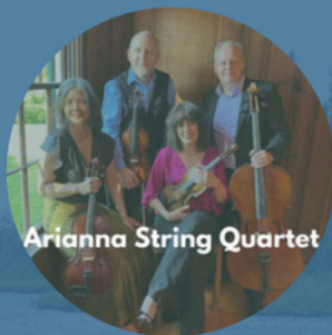
Arianna String Quartet